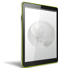
IPad or Android tablet