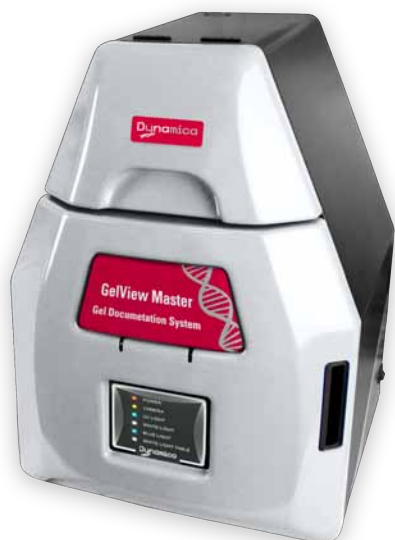
GelView Master (standard version)