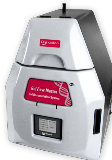
GelView Master Wi-Fi (Wi-Fi version)